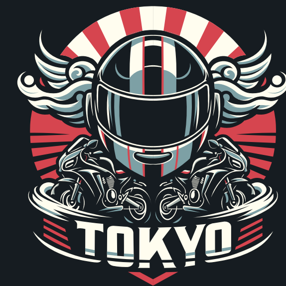
LINES AND COLORS OF TOKYO STYLE